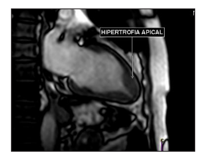
Figure 3. Cardiac MR with typical apical hypertrophic cardiomyopathy changes.

The clinical practice guideline and clinical trials support the use of implantable cardioverter-defibrillators (ICDs) for primary prevention of sudden death (SD) in the following cases: 1) a family history of sudden cardiac death, 2) unexplained syncope, 3) asymptomatic nonsustained ventricular tachycardia, 4) abnormal blood pressure response to exercise, and 5) left ventricular wall thickness greater than