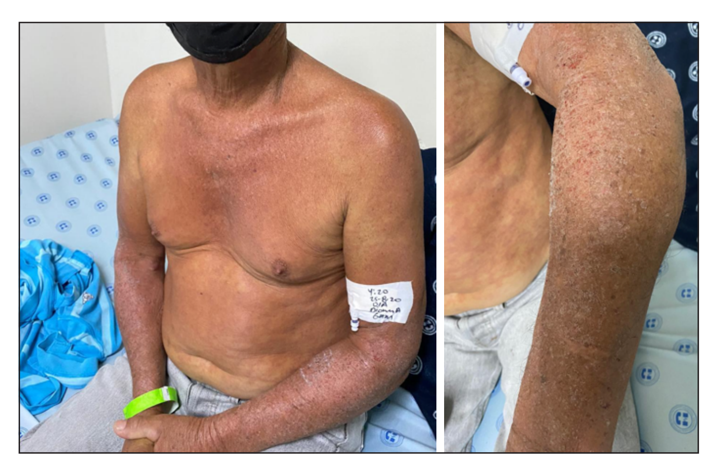
Figure 1. Widespread erythematous, scaly, itchy lesions involving the face, chest, abdomen and extremities.